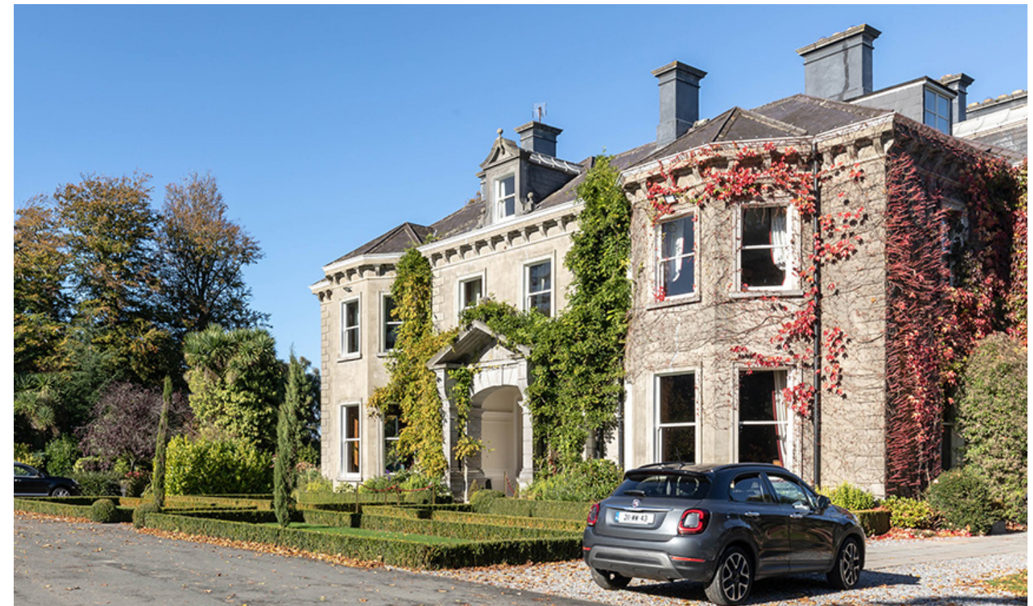
Tinakilly House Hotel