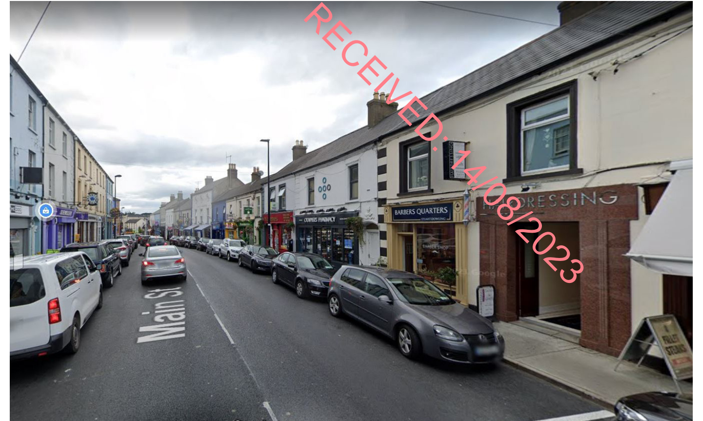
Wicklow Town Main Street

For context purposes, street view images are included opposite along with diagrams on the following pages.